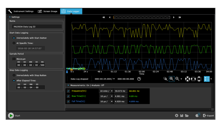
Easily configure parallel channels and visualize data logs of current, voltage, power, measurements, and analyses.

Quickly configure your Keysight power analyzers and see your measurements across multiple channels with one simple interface.